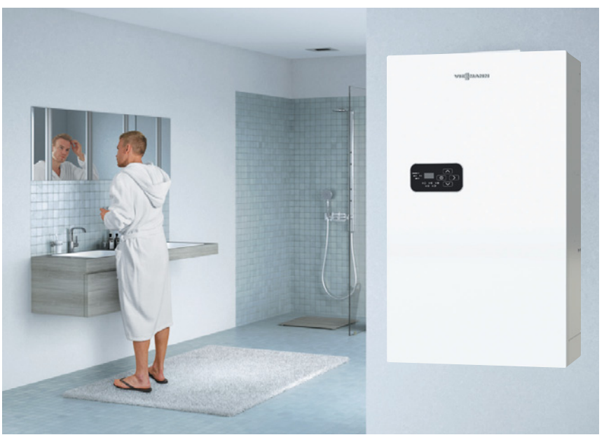
Vitotron 100, VLN2 electric low temperature heating boiler is environmentally responsible and efficient heating source.

The Vitotron 100 is the easiest way to add hydronic space heating to new and existing systems, with a space saving design and integrated components for a fast and simple installation.