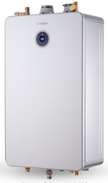
Greentherm T9900i SE indoor