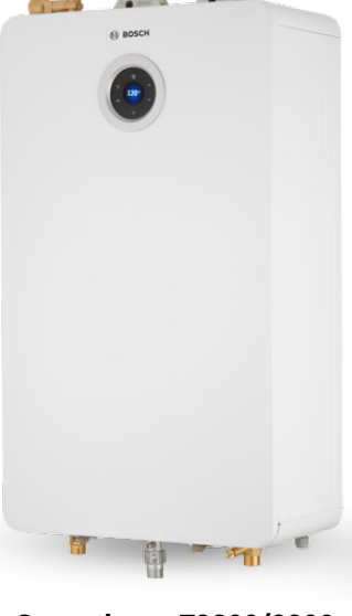
Greentherm T9800/9900 SE Indoor