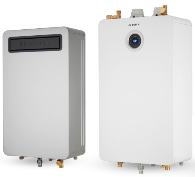
Greentherm T9800 SE outdoor

This flexible condensing high-efficiency low NOx gas tankless water heater is the first of its kind. It delivers endless hot water on demand, along with a user-friendly connected interface, easy installation, and best of all, peace of mind.